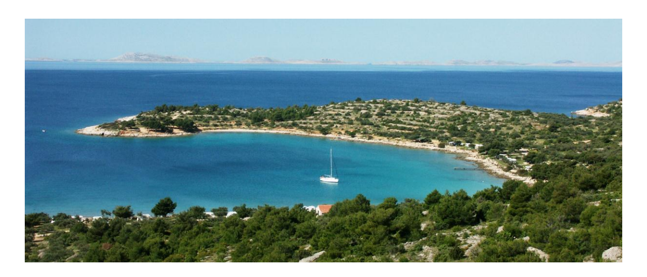
A guide for the first time charterer

The European Boating Association (EBA) is a civil, not for profit, recreational boat users' association, founded in 1982. The purpose of the EBA is to represent the mutually agreed common interests of national recreational boating unions and associations and to coordinate and develop recreational boating activities in Europe. Web: www.eba.eu.com